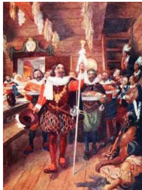
The Order of Good Cheer by C.W. Jefferys (1925)

The first official, annual Thanksgiving in Canada was celebrated on 6 November 1879, though Indigenous peoples in Canada have a history of celebrating the fall harvest that predates the arrival of European settlers. Sir Martin Frobisher and his crew are credited as the first Europeans to celebrate a Thanksgiving ceremony in North America, in 1578. They were followed by the inhabitants of New France under Samuel de Champlain in 1606. The celebration featuring the uniquely North American turkey, squash and pumpkin was introduced to Nova Scotia in the 1750s and became common across Canada by the 1870s.