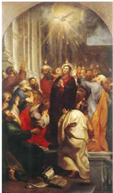
Reubens, Descent of the Holy Spirit (1619)