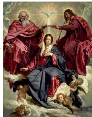
Coronation of the Virgin, Diego Velazquez, 1645

Dear friends, devotion to Our Lady is an important element in our spiritual lives. In our prayer, let us not neglect to turn trustfully to her. Mary will not neglect to intercede for us next to her Son. In looking to her, let us imitate her faith, her complete availability to God's plan of love, her generous welcoming of Jesus. Let us learn to live by Mary. Mary is the Queen of heaven who is close to God, but she is also the Mother who is close to each one of us, who loves us and who listens to our voice.