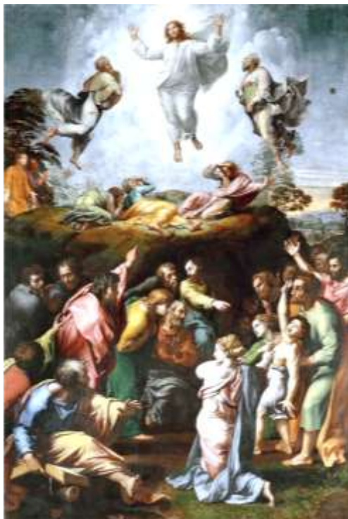
The Transfiguration, Raphael 1483-1520

Jesus took Peter, James, and his brother John, and led them up a high mountain apart by themselves. And he was transfigured before them, and his clothes became dazzling white, such as no fuller on earth could bleach them. --Mark 9:2-3