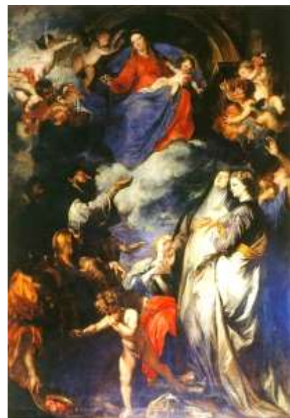
Madonna of the Rosary by Anthony van Dyck, 1623, Collection: Oratorio del Rosario di San Domenico, Palermo

https://www.signupgenius.com/go/8050B4BAFAA2DA1FB6-olp37