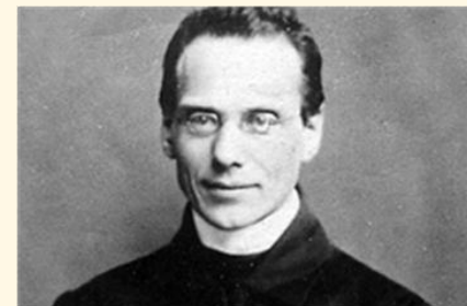
Blessed Francis Xavier Seelos Feast Day: October 5

Zeal as a preacher and a confessor led Father Seelos to works of compassion as well. Born in southern Bavaria, he studied philosophy and theology in Munich. On hearing about the work of the Redemptorists among German-speaking Catholics in the United States, he came to this country in 1843.