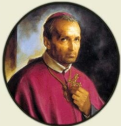
PRAY FOR US!